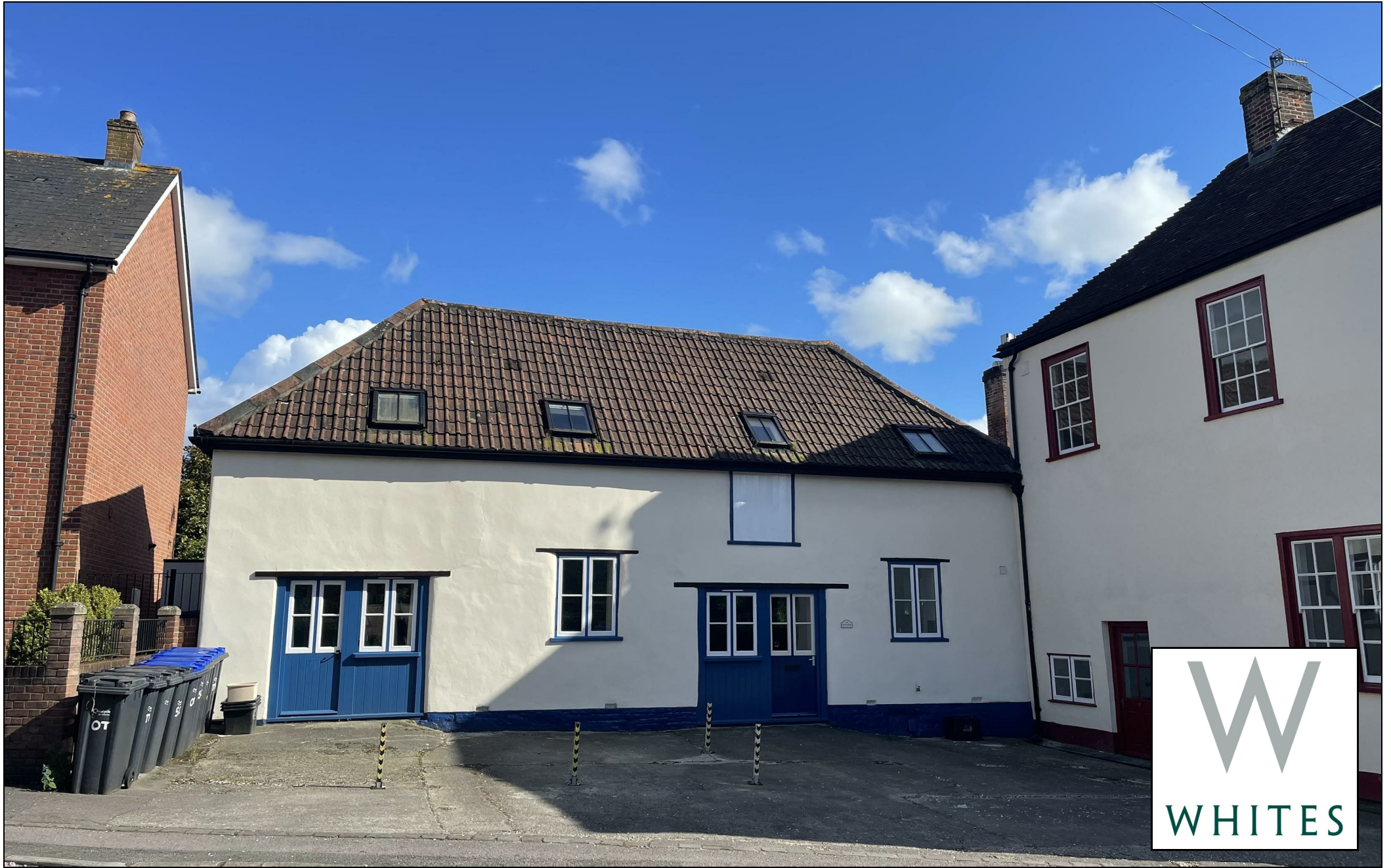
The Coach House 2a Tollgate Road, Salisbury, Wiltshire, SP1 2HZ